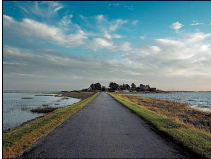
"Bay of Love", in the heart chakra of Samsøe Island