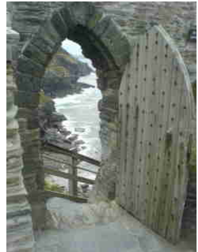
Stairway to Tintagel – King Arthur's castle