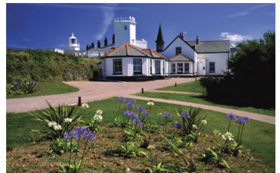
Lizard Point YHA - 5 star hostel – our base