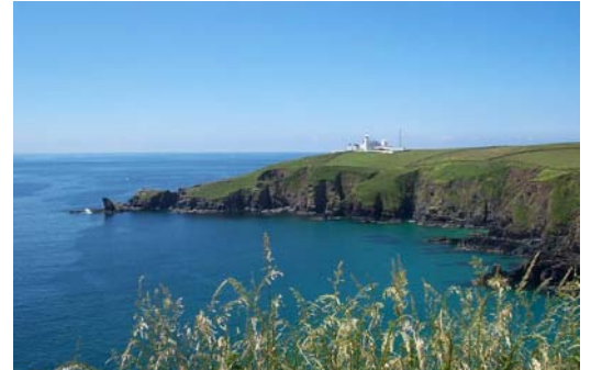
Lizard Point with our hostel located in a unique setting

21.00-22.30 Evening process with deeksha