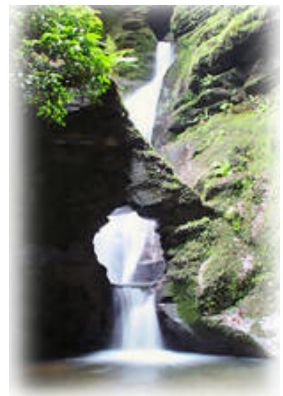
St Nectans Glen and Waterfall