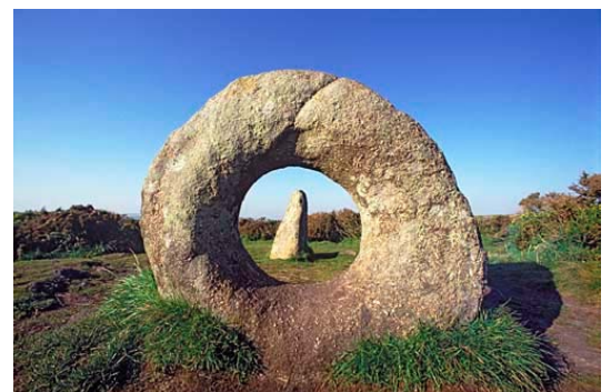
Men-an-Tol, sacred stones, courtesy of Sacredsites.com