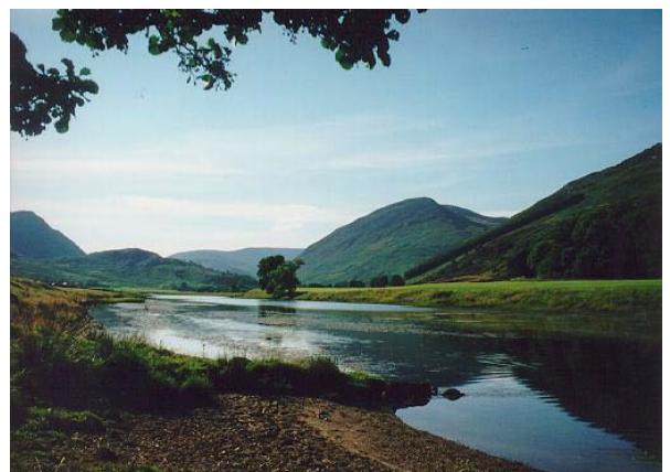
The powerful Glen Lyon – valley of the Sun God