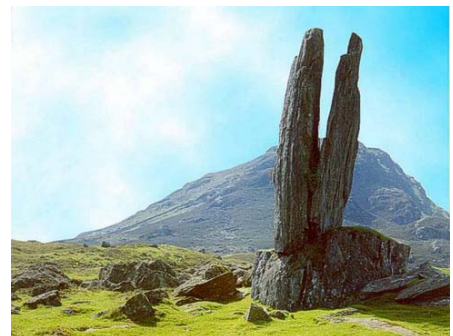
and experience Deeksha in nature...here the site “Praying hands of Mary” in the Valley of the Sun God – Glen Lyon...