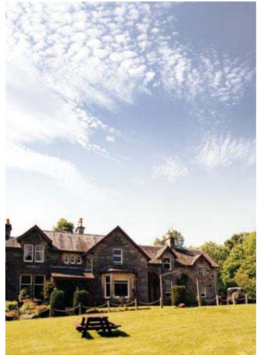
Lendrick Lodge – our base