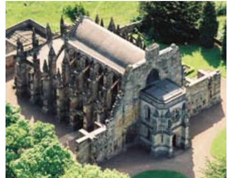
Rosslyn Chapel – called “magical” by visitors - perhaps the most famous sacred site in Scotland

Sacred site visits will mostly around lunch/afternoon. We will arrange joint transportation from Lendrick to the various sites. See tentative daily schedule next page.