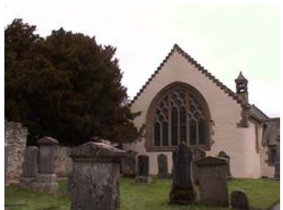
The sacred Yew-tree by Fortingall Church. The tree is 5000 years old and the oldest living being in Europe – if not the world.